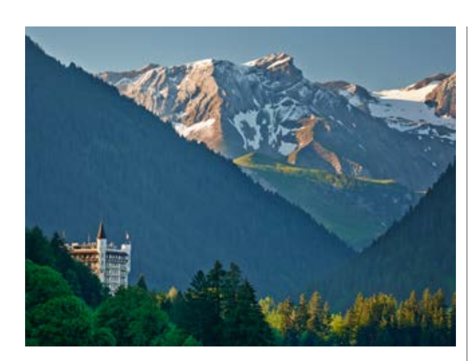
Right: the Gstaad Palace guarantees spectacular views with its alpine setting. Opposite: (clockwise) enjoy elegant dining, understated luxury in the rooms and a relaxing Jacuzzi, or unwind in the inviting lounge of the Palace

Check in and feel at home: the Gstaad Palace has been welcoming guests from all over the world since 1913 as they enjoy its refined hospitality and stunning location overlooking the Swiss Alps