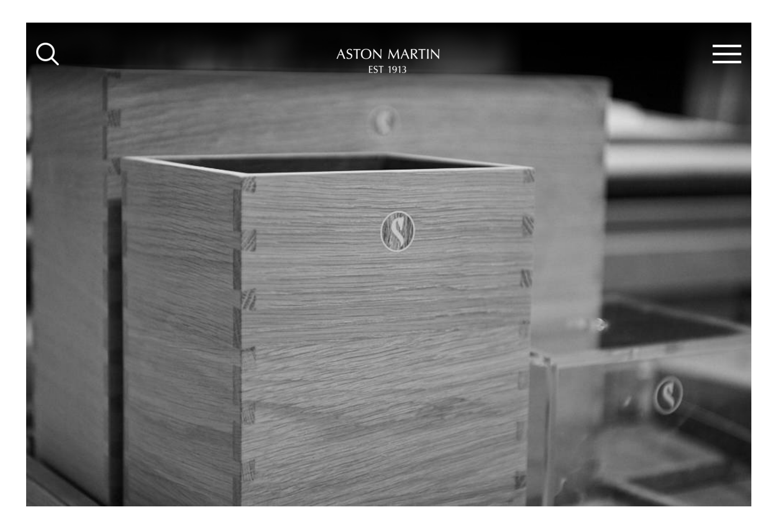
Detail of Smallbone's accessory boxes in dovetailed oak from the Wallpaper* Handmade collaboration

"For us, bespoke really does mean bespoke," says Godwin. "As long as it is fundamentally safe and we can stand behind it as a Smallbone project, we do not adhere to rules – we work to achieve very specific design briefs, with clients who want something unique. For instance, one commission saw us make a super-luxe statement kitchen for a country estate, with client-chosen veneers and internally lit jewel onyx worktops. Another project was in a Cornish seaside peninsula property with a beautiful curved tower, which called for a completely circular set of rooms. A kitchen, an island and a bar were finished in high-gloss smoked eucalyptus veneer with curved glass cabinets and mirrors, reflecting the truly spectacular vista."