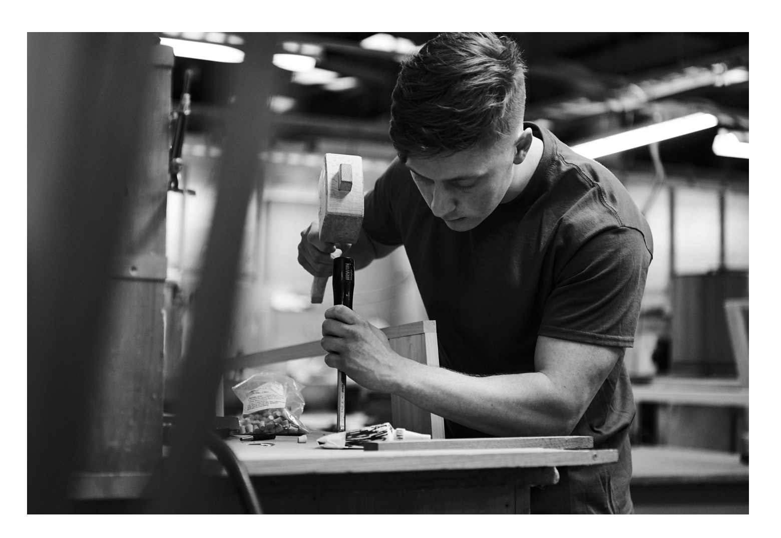
For 40 years, Smallbone's talented team of craftspeople have produced elegant, sought-after pieces.

At the workshop, sawn timber starts its journey in the dedicated timber mill, before being prepared ready for its journey through the assembly lines that conclude with their rigorous Quality Control department. Only the finest materials are sourced from around the world, from FSC-certified hardwoods from some of the oldest forests of Europe, Russia and the Americas, to semi-precious marbles and granites from Italy, India, China and Brazil. Smallbone also uses exotic veneers like Macassar and Lacewood, which are sourced and held specifically for the brand.