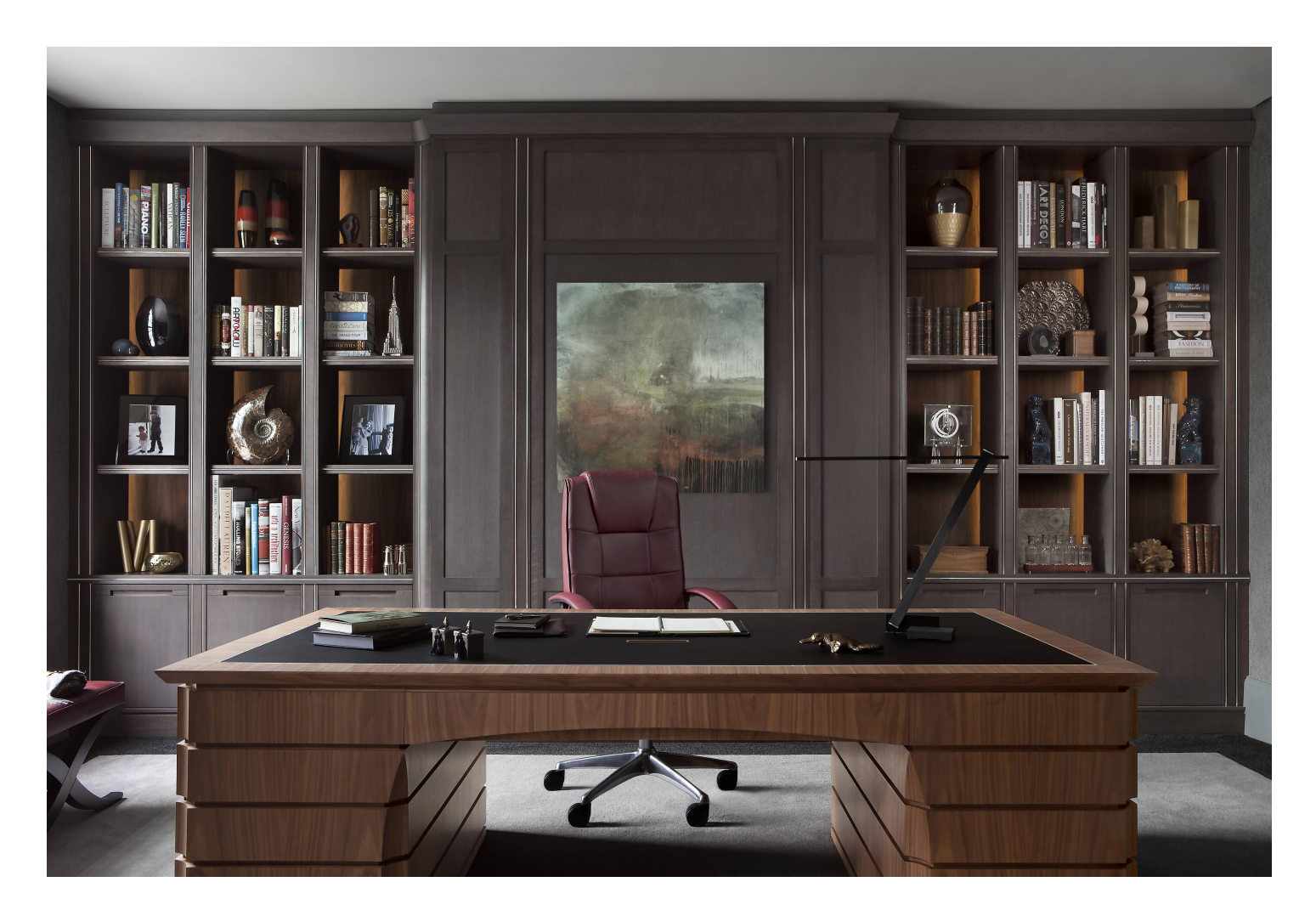
The Smallbone desk inspired by the quoined detail of Georgian architecture

Although kitchens remain an integral part of the business, Smallbone has expanded its repertoire with designs for other spaces, strong bedrooms and bathrooms to dedicated environments for work, media and even collectibles. Combining tactile, hands-on craftsmanship with the latest technology, the brand is leading traditional cabinetry into the 21st century.