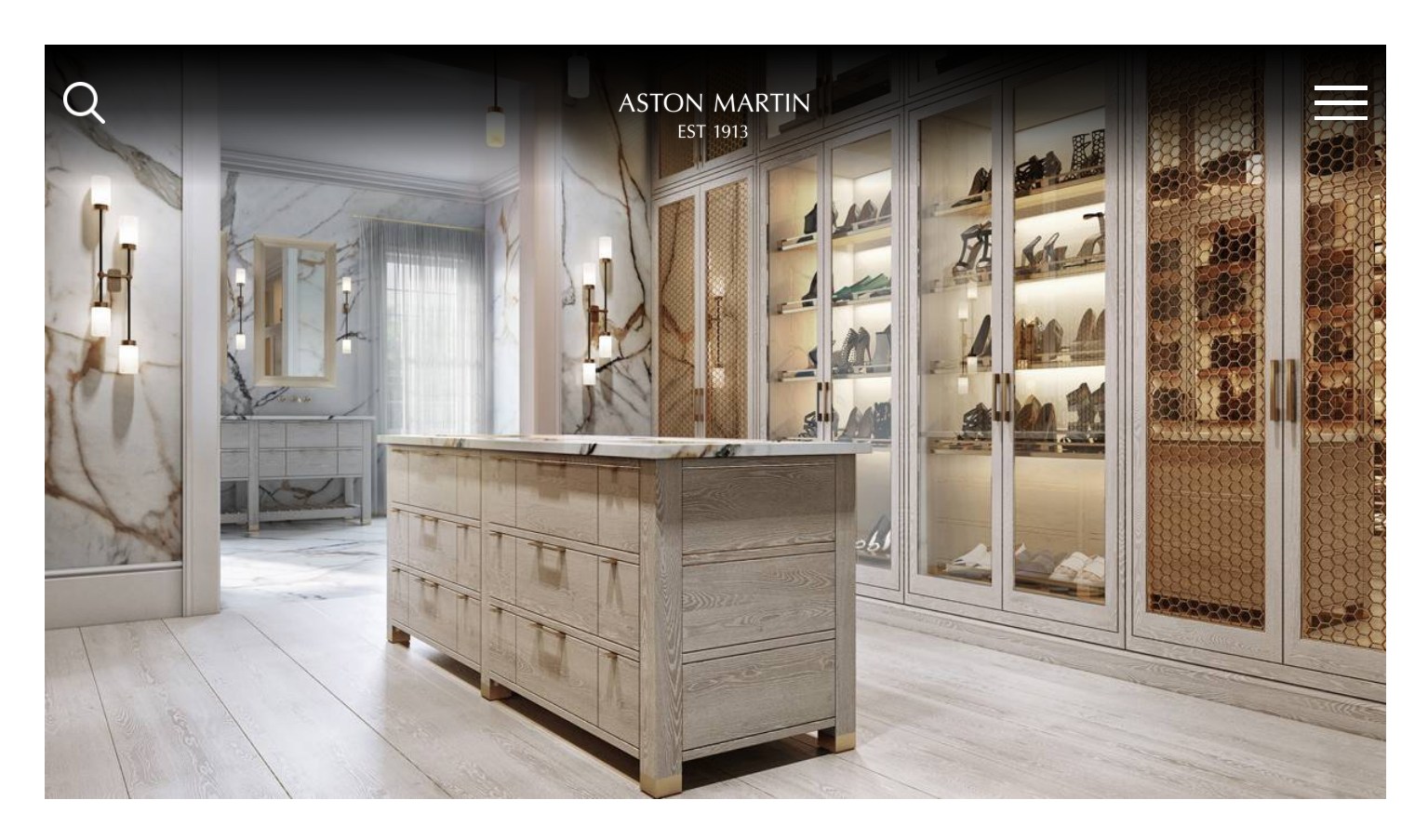
The dressing rooms are hand-painted by one of its team of decorative artists

Once the designs have been developed, state of the art CGI's are then prepared before Smallbone's workshop and project management teams take over and prepare detailed drawings for the cabinet makers to begin their craft. At the workshop, artisanal skills such as timber selection, veneer work and finishing skills are put into play, in addition to applying expert knowledge of how the material parts will work together and cope with today's climate-controlled environments. Smallbone also works alongside the client's builders to provide the details needed to prepare the space for the finished furniture.