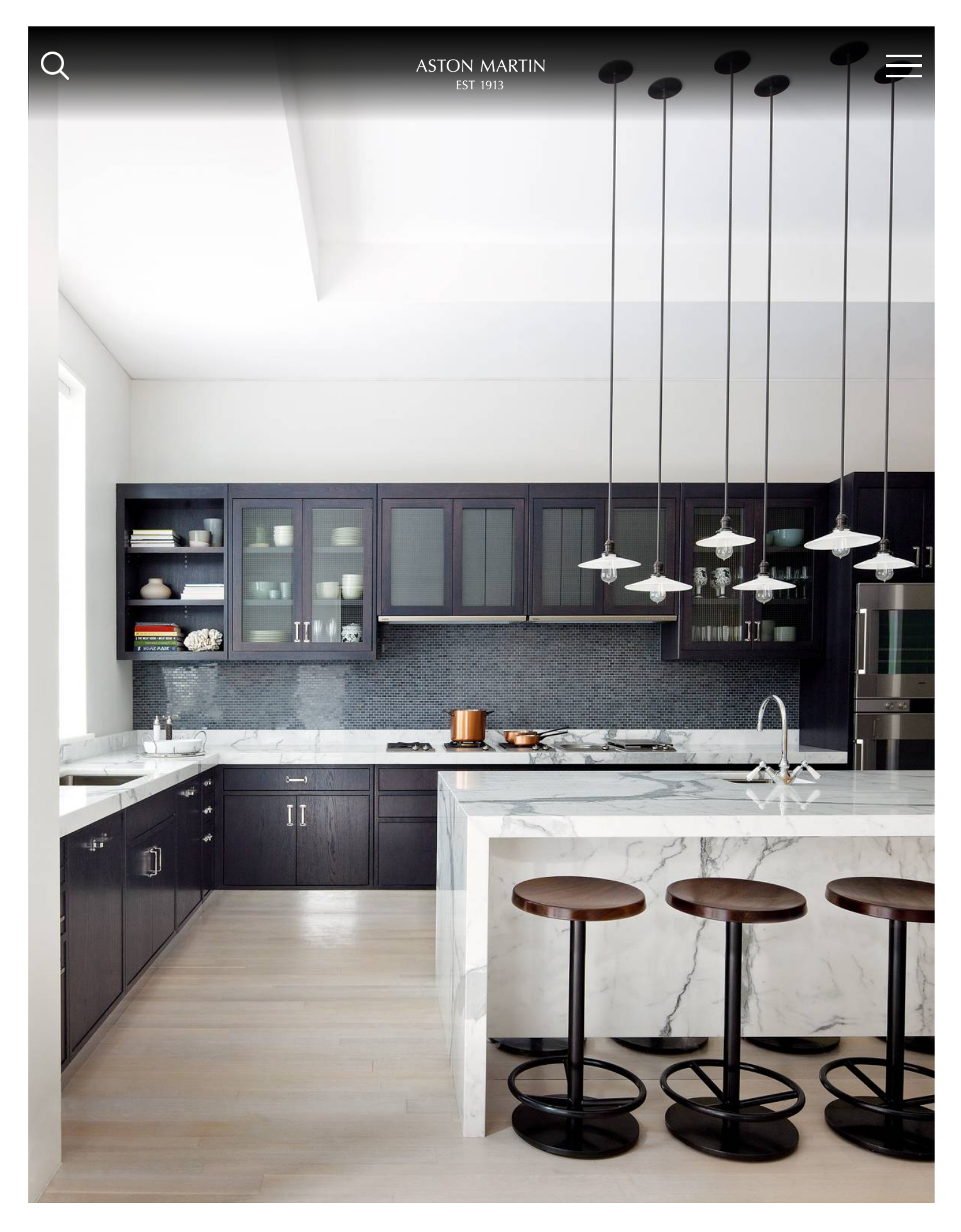
The clean lines of the Mulberry range are inspired by a bespoke commission for a boutique development in New York's Soho